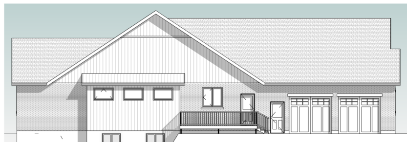
LEFT 1" = 20'-0"