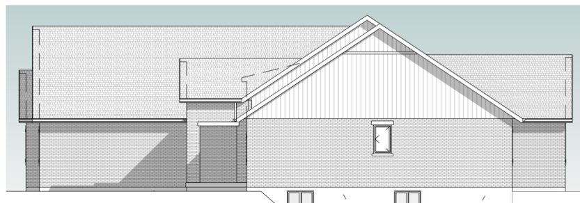
RIGHT 1" = 20'-0"