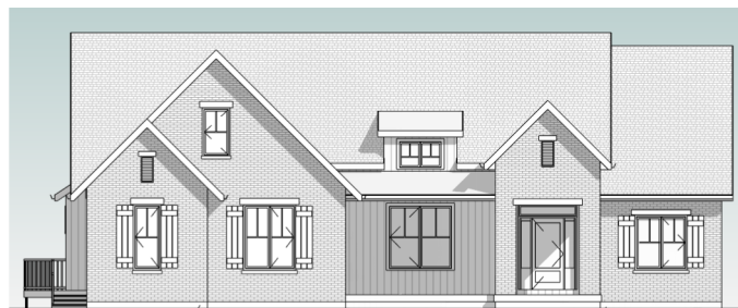
FRONT 1" = 20'-0"